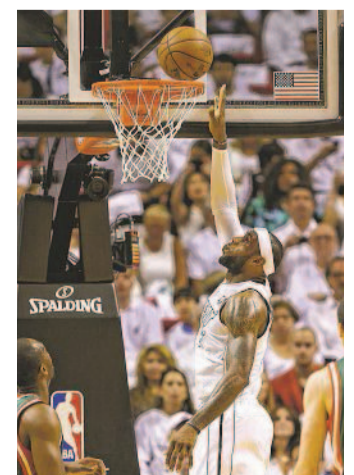
Miami's LeBron James drives to the rim during Game 2 against Milwaukee.