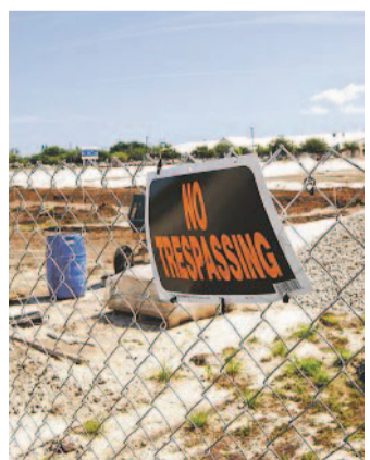
BCC's soccer field is expected to be ready for the women's team opener in August.